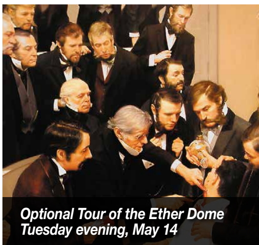
Optional Tour of the Ether Dome Tuesday evening, May 14